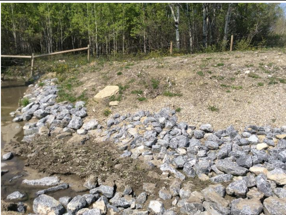
Photo 38 View northeast from WQ-05b sample site, located downslope of the SWCRR Project and Wetland 09. Photo taken during spring sampling on May 29, 2019.