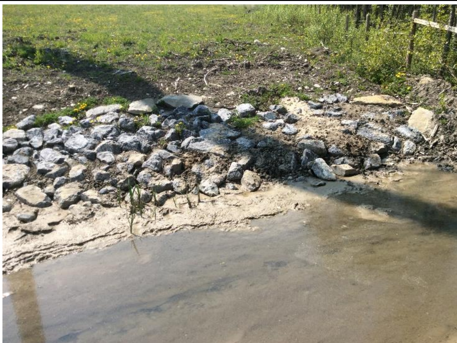
Photo 37 View northwest from WQ-05b sample site, located downslope of the SWCRR Project and Wetland 09. Photo taken during spring sampling on May 29, 2019.