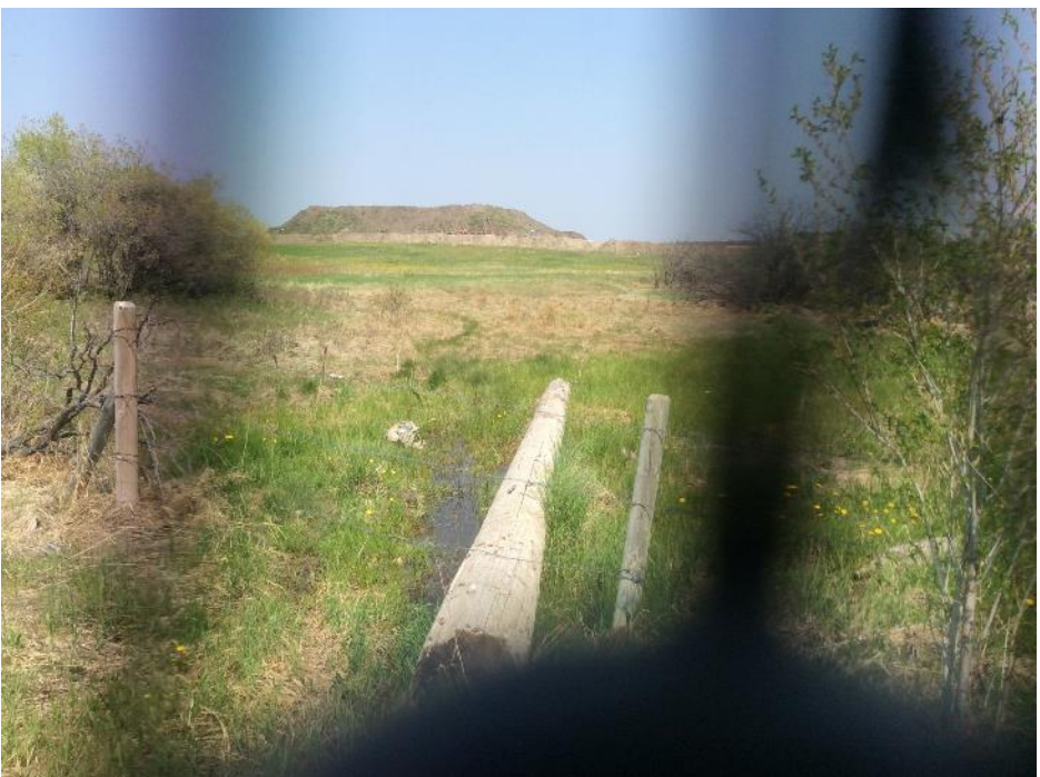
Photo 48 View east of the WQ-5a sample site, located upslope of the SWCRR Project within Wetland 09. Photo taken during spring sampling on May 29, 2019.