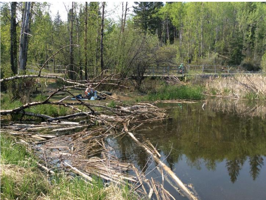
Photo 22 View south from WQ-03 sample site, located within Wetland 06. Photo taken during spring sampling on May 29, 2019.