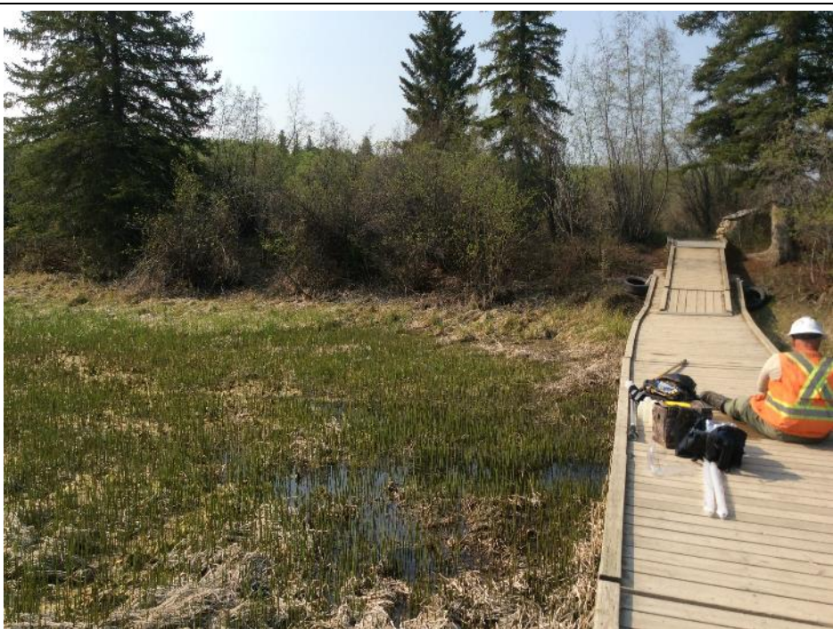
Photo 5 View south from WQ-01 sample site, located within the Reference Wetland. Photo taken during spring sampling on May 29, 2019.