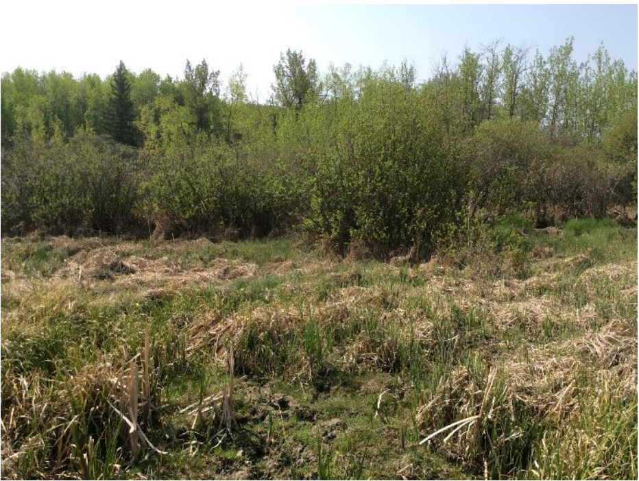
Photo 14 View south from WQ-02 sample site, located within Wetland 06. Photo taken during spring sampling on May 29, 2019.