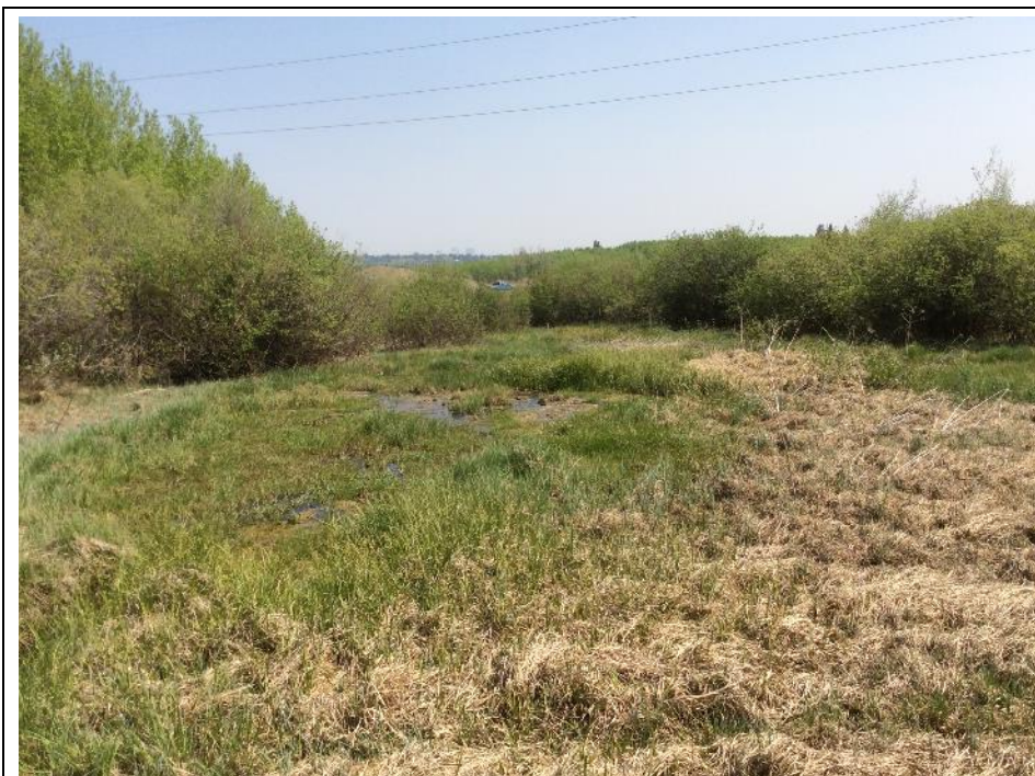
Photo 43 View east from WQ-4a sample site, located upslope of the SWCRR Project within Wetland 08. Photo taken during spring sampling on May 29, 2019.