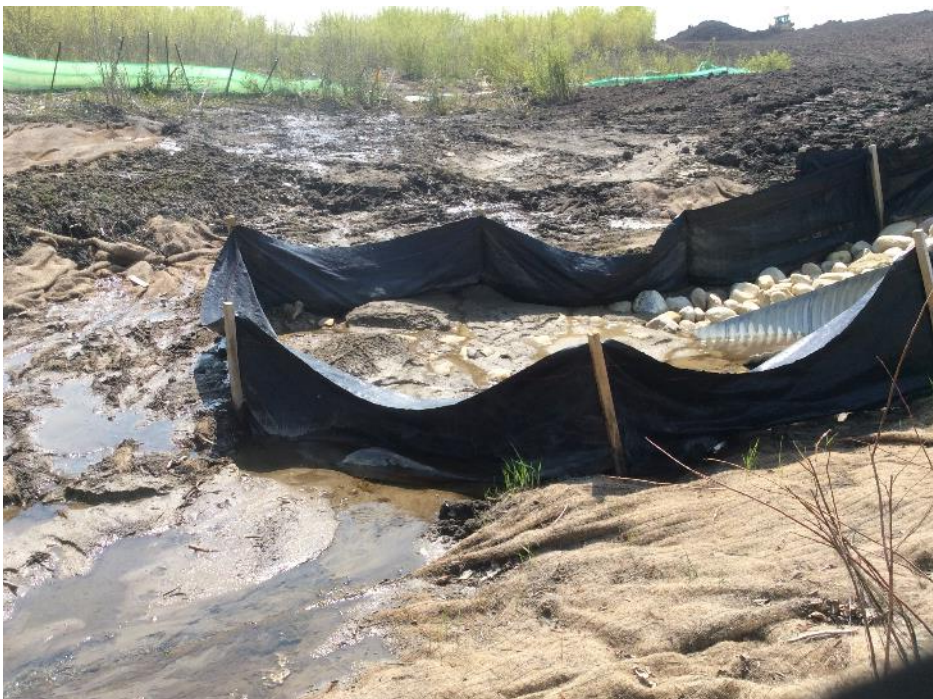
Photo 27 View south from WQ-04b sample site, located downslope of the SWCRR Project and Wetland 08. Photo taken during spring sampling on May 29, 2019.