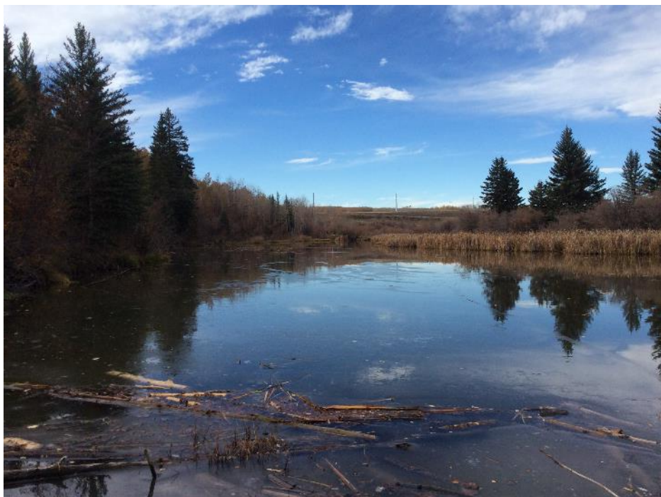
Photo 23 View east from WQ-03 sample site, located within Wetland 06. Photo taken during fall sampling on October 16, 2019.