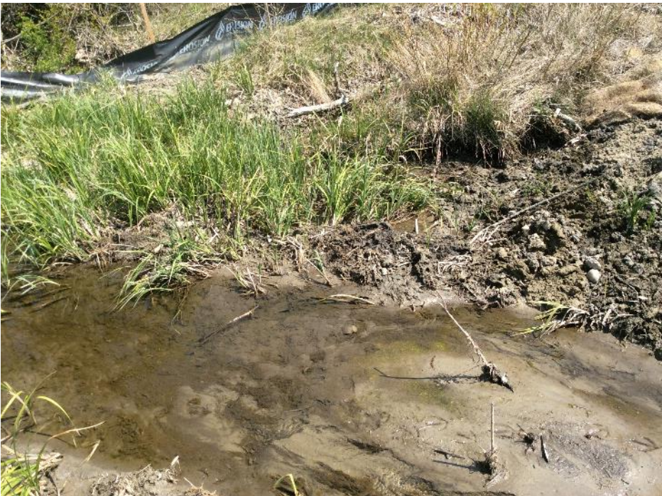
Photo 30 View southeast from WQ-04b sample site, located downslope of the SWCRR Project and Wetland 08. Photo taken during spring sampling on May 29, 2019.