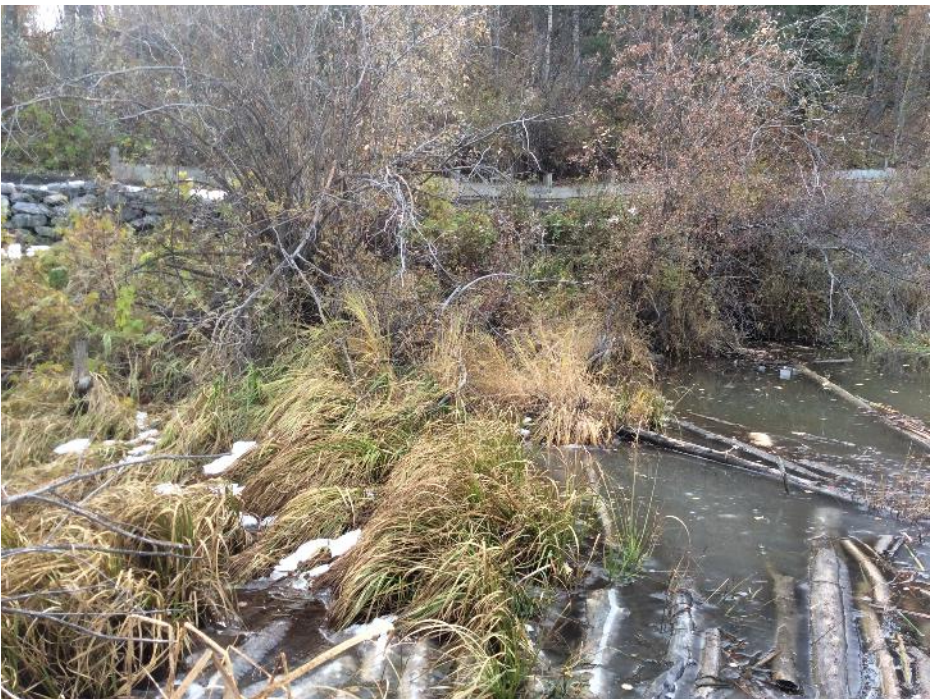
Photo 26 View south from WQ-03 sample site, located within Wetland 06. Photo taken during fall sampling on October 16, 2019.