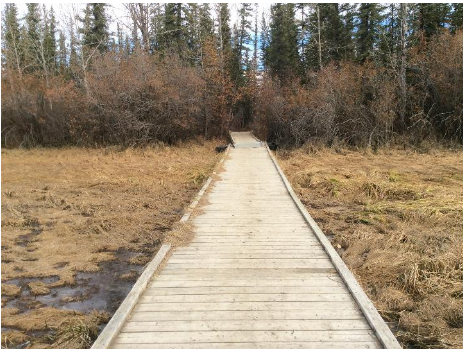
Photo 9 View north from WQ-01 sample site, located within the Reference Wetland. Photo taken on October 16, 2019.