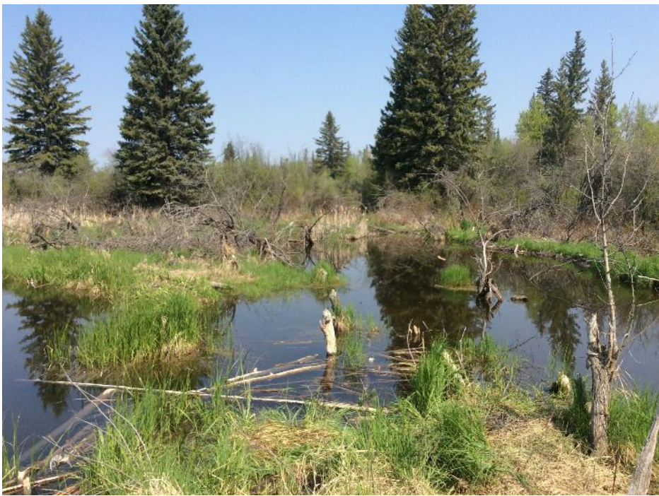
Photo 20 View west from WQ-03 sample site, located within Wetland 06. Photo taken during spring sampling on May 29, 2019.