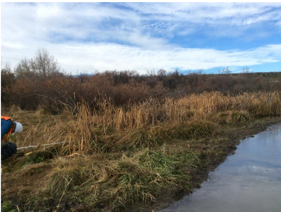
Photo 18 View southwest from WQ-02 sample site, located within Wetland 06. Photo taken during fall sampling on October 16, 2019.