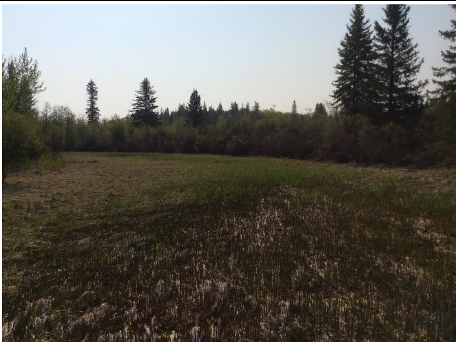
Photo 2 View west from WQ-01 sample site, located within the Reference Wetland. Photo taken on May 29, 2019.