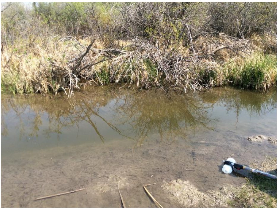
Photo 13 View north from WQ-02 sample site, located within Wetland 06. Photo taken during spring sampling on May 29, 2019.