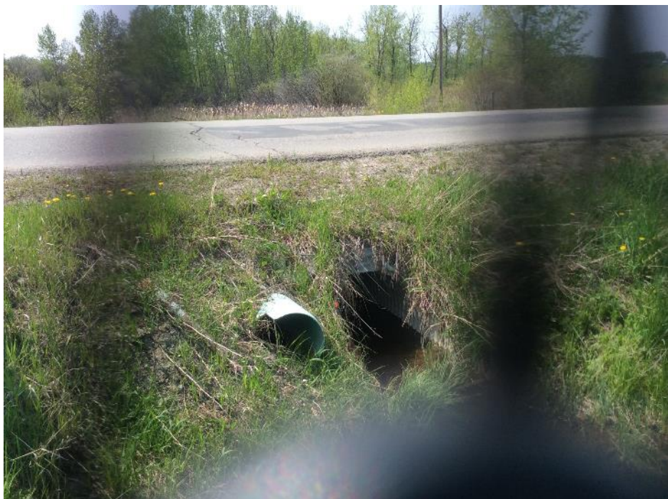
Photo 47 View west of the WQ-5a sample site, located upslope of the SWCRR Project within Wetland 09. Photo taken during spring sampling on May 29, 2019.