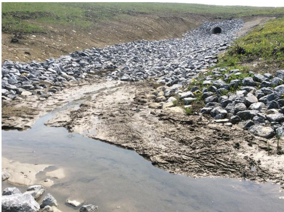
Photo 35 View southwest from WQ-05b sample site, located downslope of the SWCRR Project and Wetland 09. Photo taken during spring sampling on May 29, 2019.