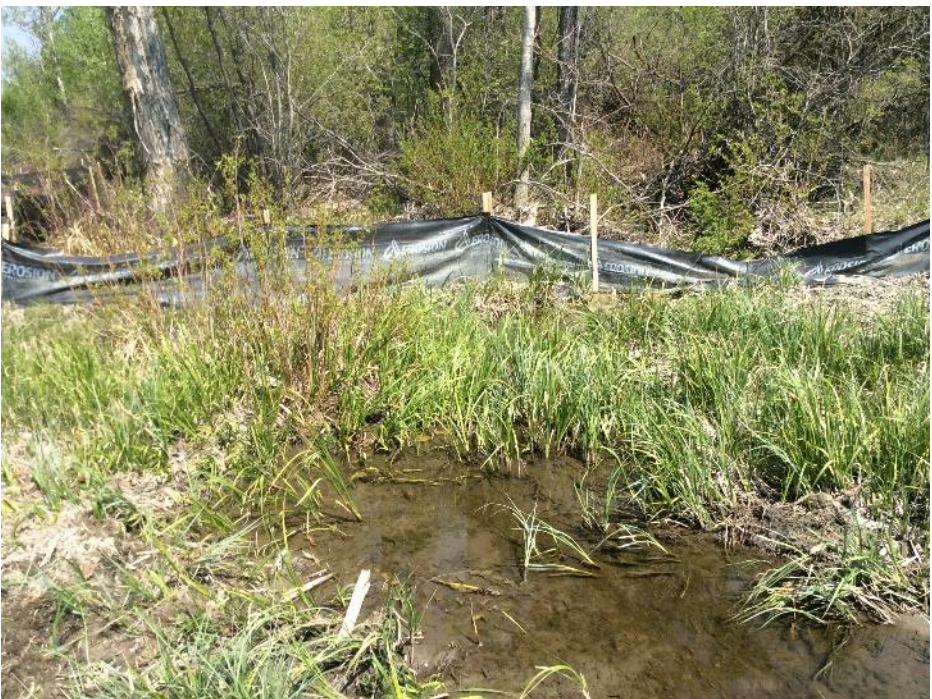
Photo 28 View north from WQ-04b sample site, located downslope of the SWCRR Project and Wetland 08. Photo taken during spring sampling on May 29, 2019.