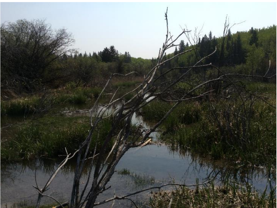
Photo 12 View west from WQ-02 sample site, located within Wetland 06. Photo taken during spring sampling on May 29, 2019.