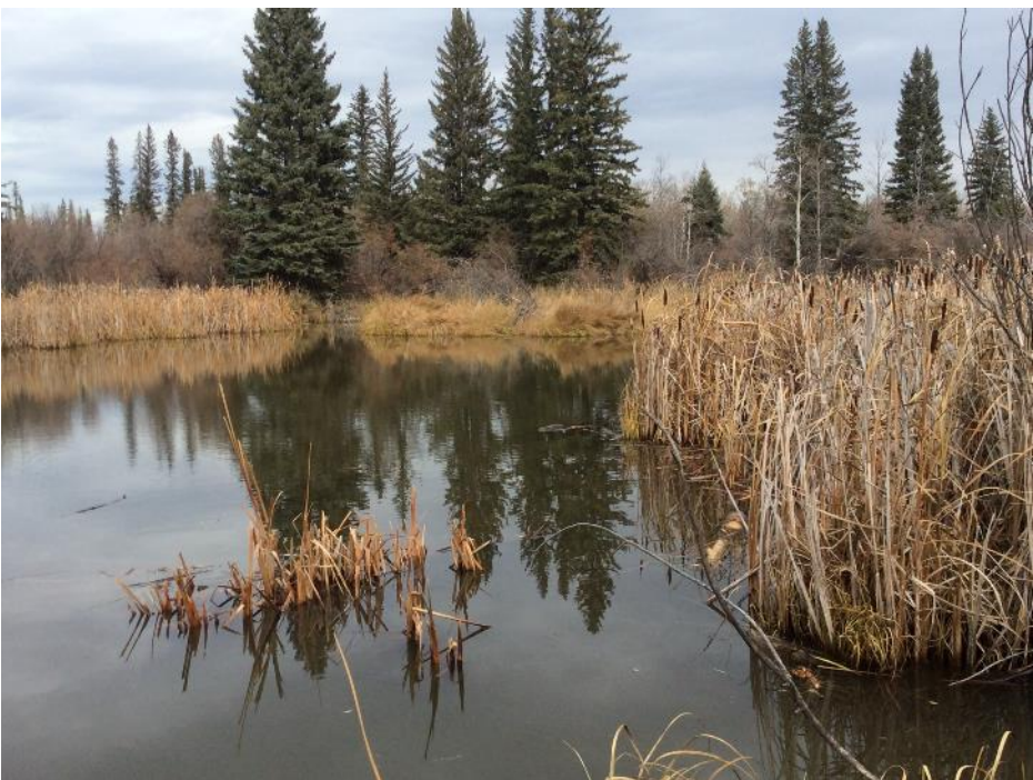
Photo 24 View west from WQ-03 sample site, located within Wetland 06. Photo taken during fall sampling on October 16, 2019.