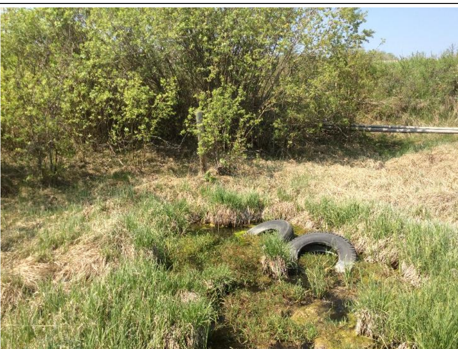
Photo 44 View north from WQ-4a sample site, located upslope of the SWCRR Project within Wetland 08. Photo taken during spring sampling on May 29, 2019.