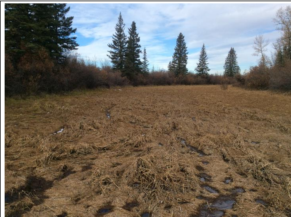
Photo 7 View east from WQ-01 sample site, located within the Reference Wetland. Photo taken during fall sampling on October 16, 2019.