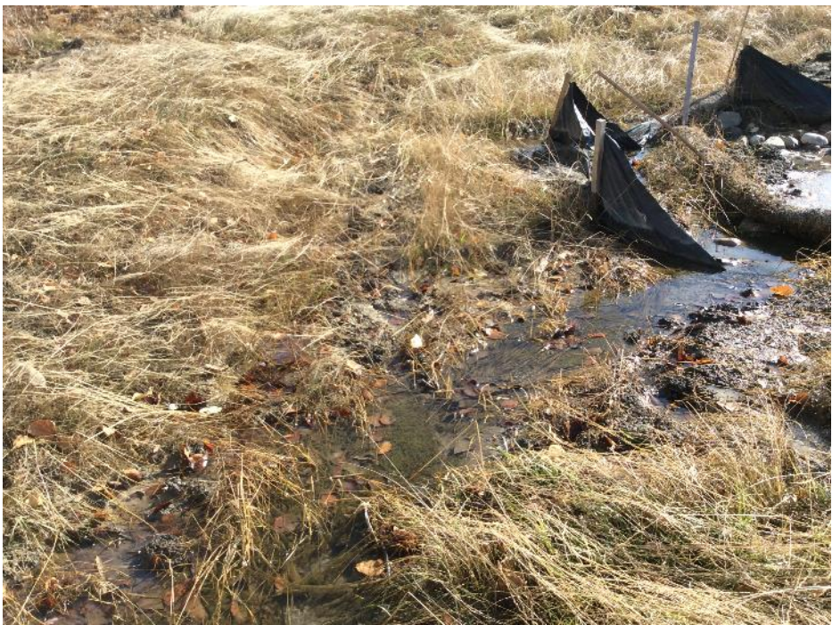
Photo 31 View south from WQ-04b sample site, located downslope of the SWCRR Project and Wetland 08. Photo taken during spring sampling on October 16, 2019.