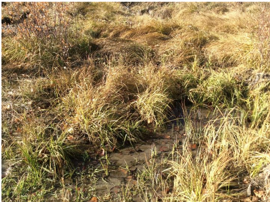
Photo 33 View east from WQ-04b sample site, located downslope of the SWCRR Project and Wetland 08. Photo taken during fall sampling on October 16, 2019.