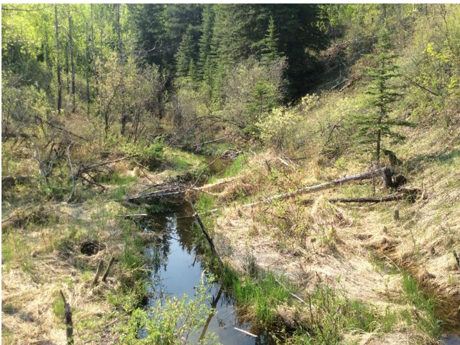
Photo 55 View upstream (south) of the FL-02 Inflow site. Photo taken during spring sampling on May 29, 2019.