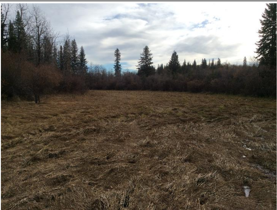
Photo 8 View west from WQ-01 sample site, located within the Reference Wetland. Photo taken during fall sampling on October 16, 2019.