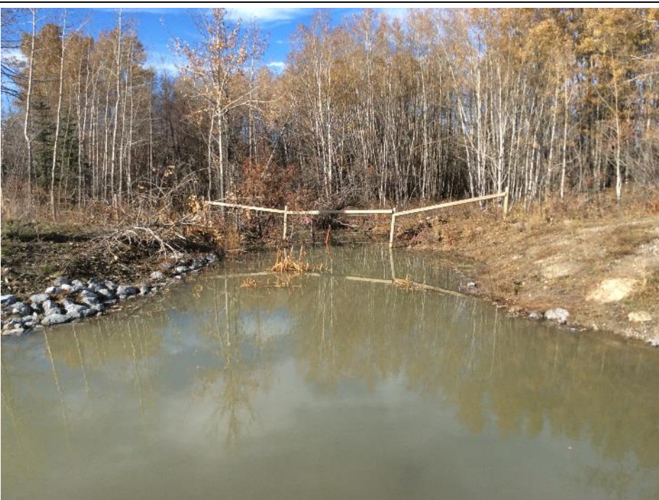
Photo 42 View north from WQ-05b sample site, located downslope of the SWCRR Project and Wetland 09. Photo taken during fall sampling on October 16, 2019.