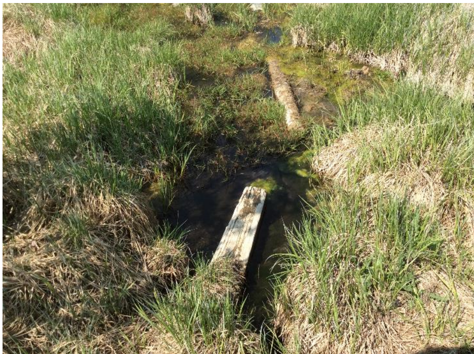
Photo 45 View of the ground conditions at the WQ-4a sample site, located upslope of the SWCRR Project within Wetland 08. Photo taken during spring sampling on May 29, 2019.