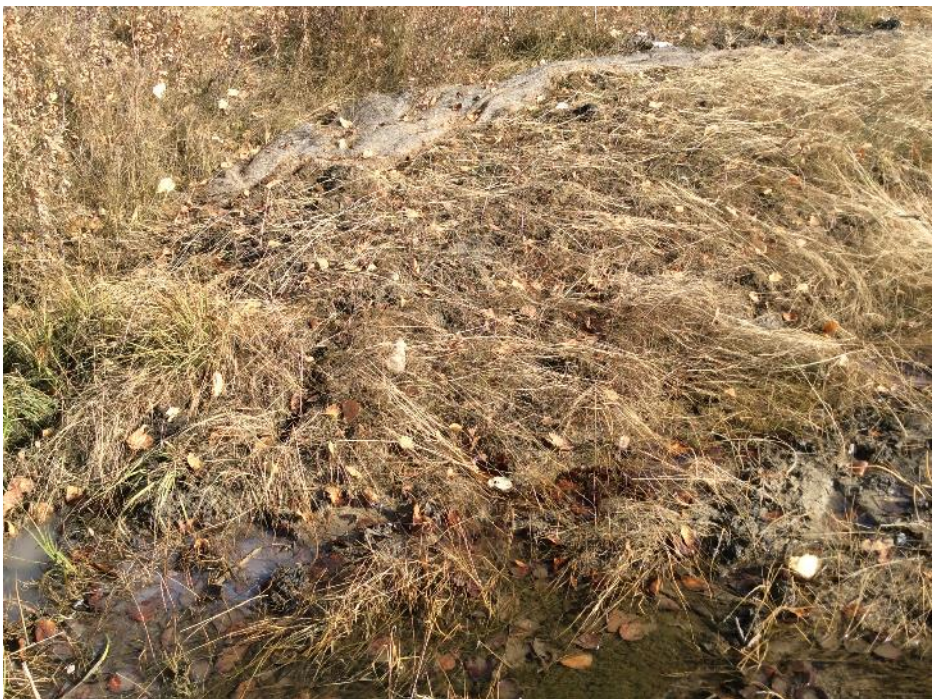
Photo 34 View west from WQ-04b sample site, located downslope of the SWCRR Project and Wetland 08. Photo taken during fall sampling on October 16, 2019.