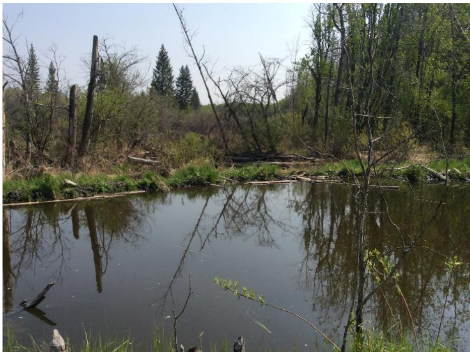
Photo 21 View north from WQ-03 sample site, located within Wetland 06. Photo taken during spring sampling on May 29, 2019.