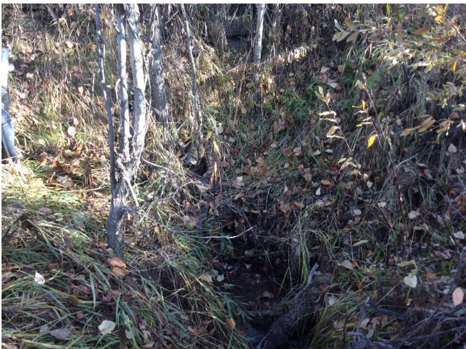
Photo 54 View downstream (northeast) of the FL-01 inflow site. Photo taken during fall sampling on October 16, 2019.