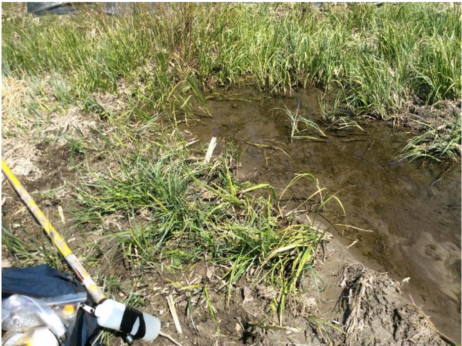
Photo 29 View of the ground of the WQ-04b sample site, located downslope of the SWCRR Project and Wetland 08. Photo taken during spring sampling on May 29, 2019.