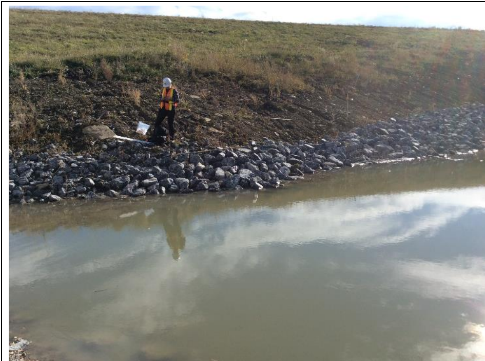
Photo 41 View south from WQ-05b sample site, located downslope of the SWCRR Project and Wetland 09. Photo taken during fall sampling on October 16, 2019.