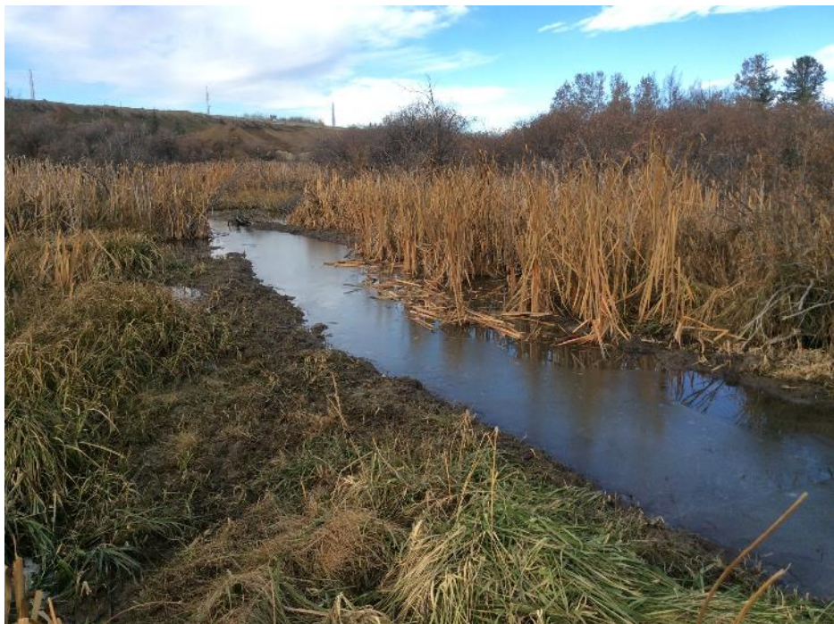
Photo 15 View east from WQ-02 sample site, located within Wetland 06. Photo taken during fall sampling on October 16, 2019.