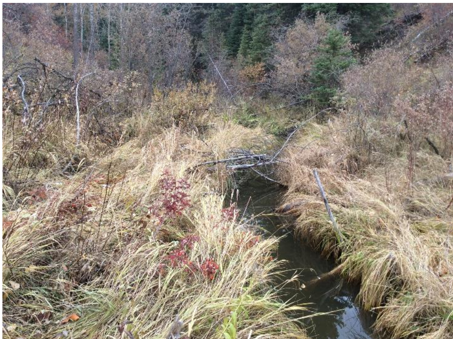
Photo 57 View upstream (south) of the FL-02 Inflow site. Photo taken during fall sampling on October 16, 2019.