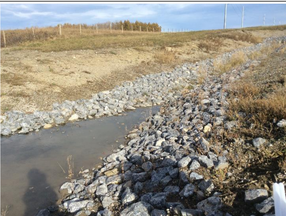
Photo 40 View southeast from WQ-05b sample site at the previous location of sample site WQ-5c, located downslope of the SWCRR Project and Wetland 09. Photo taken during fall sampling on October 16, 2019.