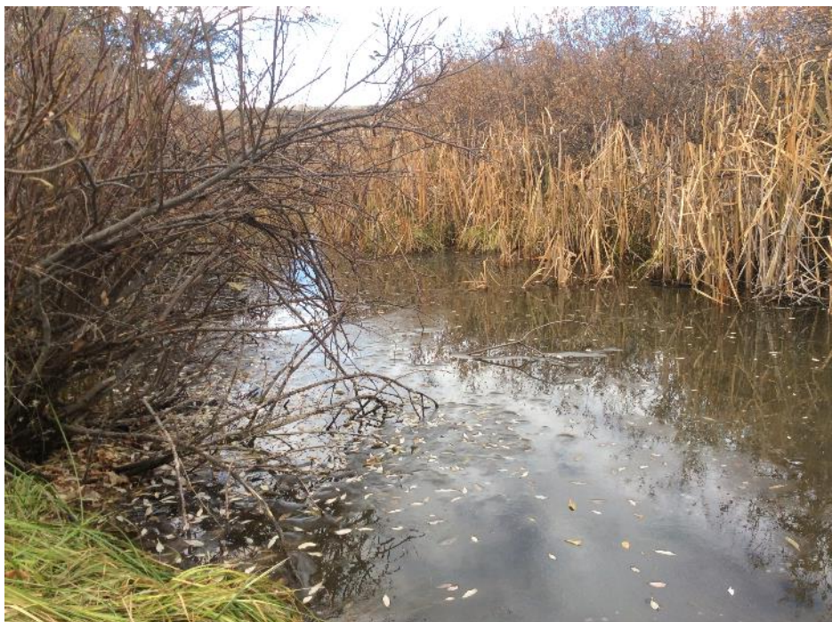
Photo 59 View downstream (southwest) of the FL-03 Inflow site. Photo taken during fall sampling on October 16, 2019.