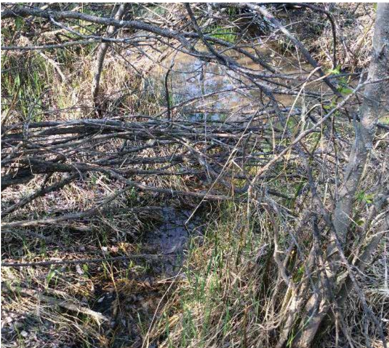
Photo 51 View upstream (southwest) of the FL-01 inflow site. Photo taken during spring sampling on May 29, 2019.