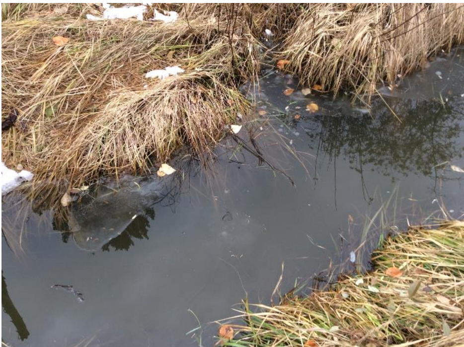
Photo 58 View of the ground conditions at the FL-02 Inflow site. Photo taken during fall sampling on October 16, 2019.