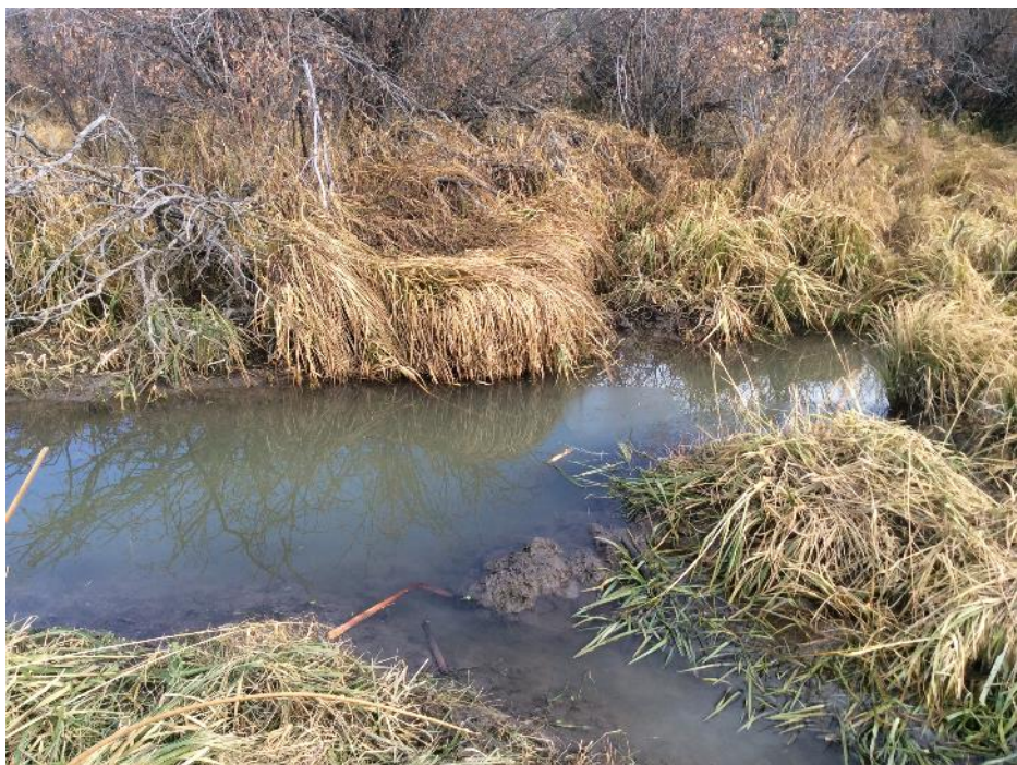
Photo 17 View north from WQ-02 sample site, located within Wetland 06. Photo taken during fall sampling on October 16, 2019.