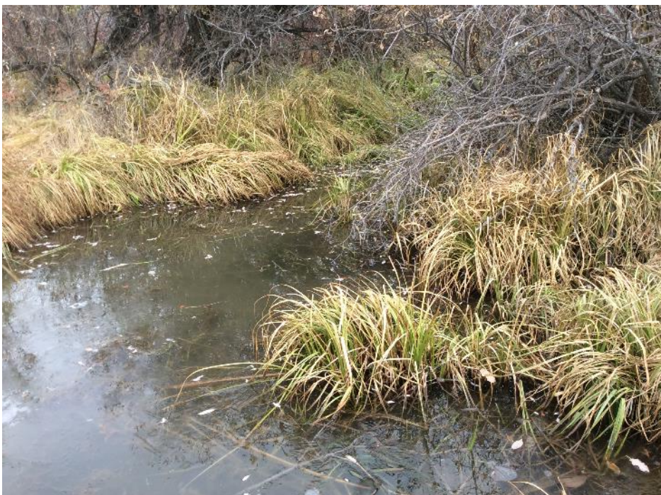
Photo 60 View upstream (southwest) of the FL-03 Inflow site. Photo taken during fall sampling on October 16, 2019.