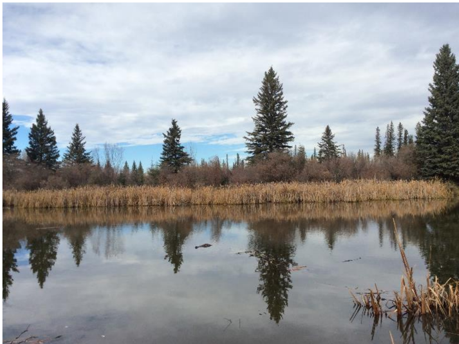
Photo 25 View north from WQ-03 sample site, located within Wetland 06. Photo taken during fall sampling on October 16, 2019.