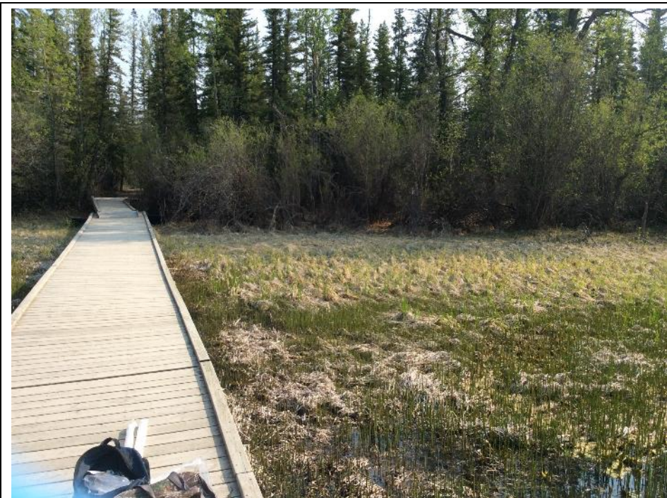
Photo 4 View north from WQ-01 sample site, located within the Reference Wetland. Photo taken during spring sampling on May 29, 2019.