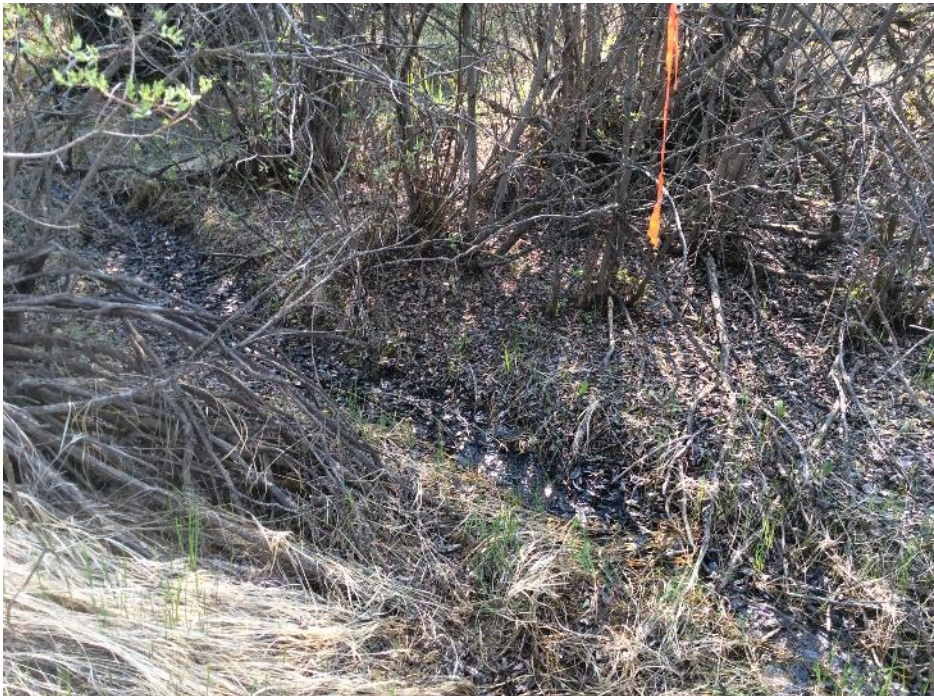
Photo 52 View southeast of the FL-01 inflow site. Photo taken during spring sampling on May 29, 2019.