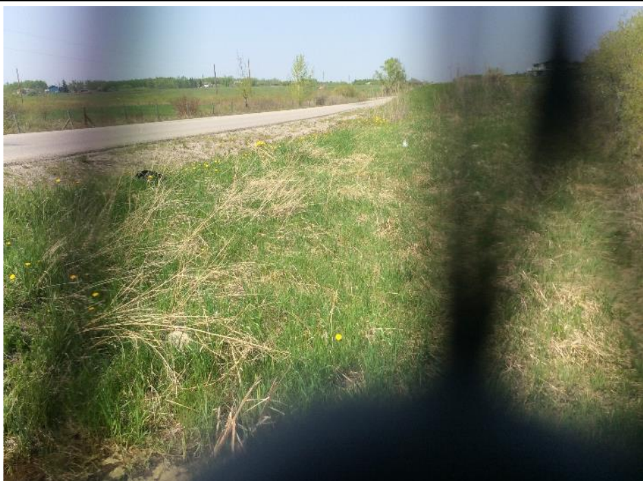
Photo 49 View north of the WQ-5a sample site, located upslope of the SWCRR Project within Wetland 09. Photo taken during spring sampling on May 29, 2019.