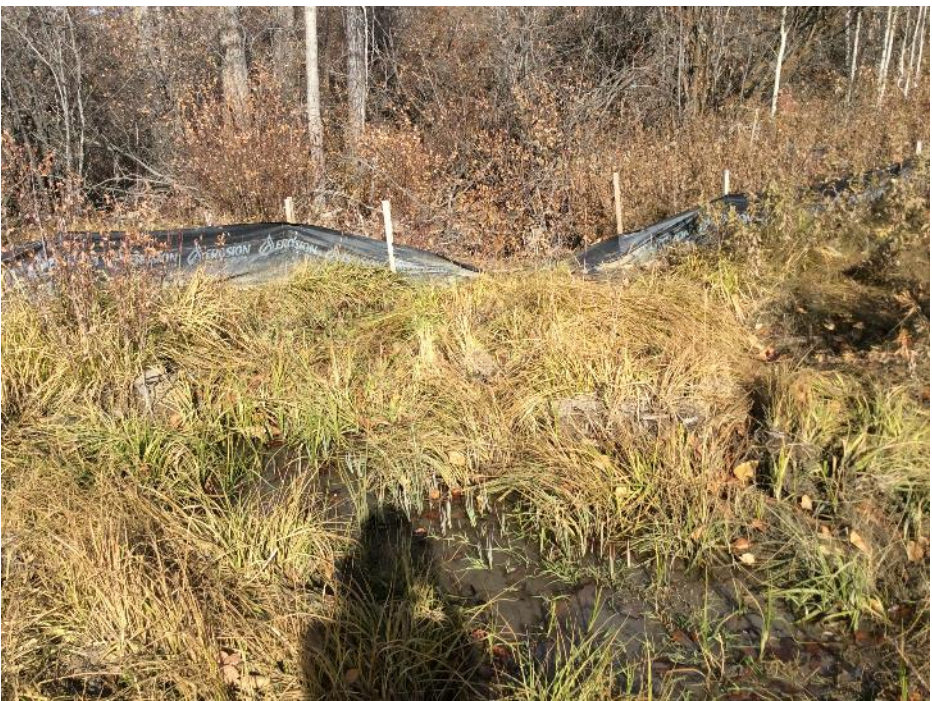
Photo 32 View north from WQ-04b sample site, located downslope of the SWCRR Project and Wetland 08. Photo taken during spring sampling on October 16, 2019.