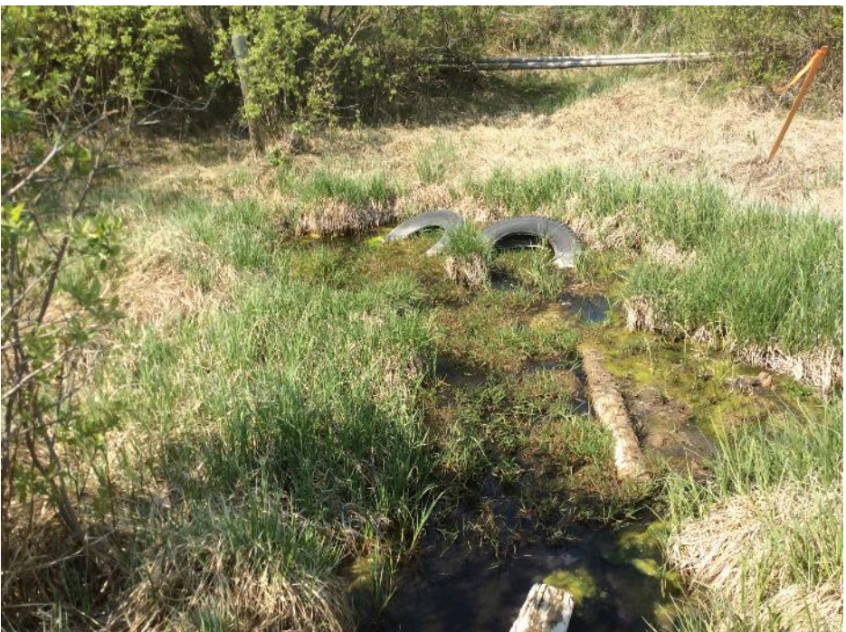
Photo 46 View of the ground conditions at the WQ-4a sample site, located upslope of the SWCRR Project within Wetland 08. Photo taken during spring sampling on May 29, 2019.