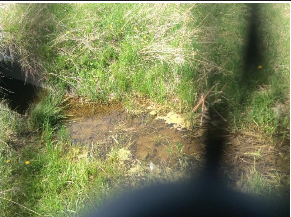
Photo 50 View of the ground conditions at the WQ-5a sample site, located upslope of the SWCRR Project within Wetland 09. Photo taken during spring sampling on May 29, 2019.