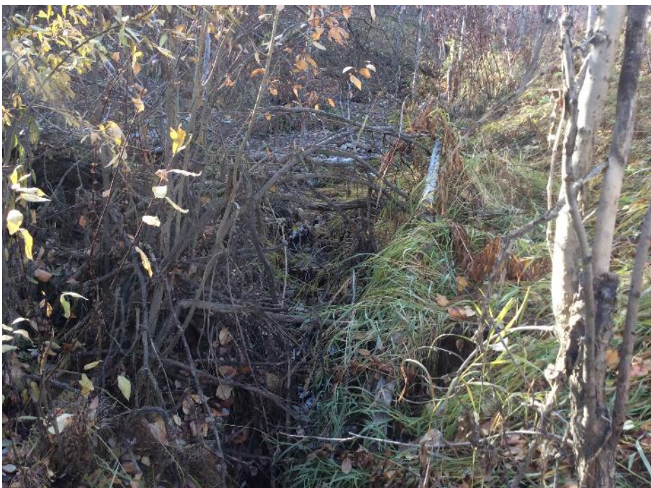
Photo 53 View upstream (southwest) of the FL-01 inflow site. Photo taken during fall sampling on October 16, 2019.