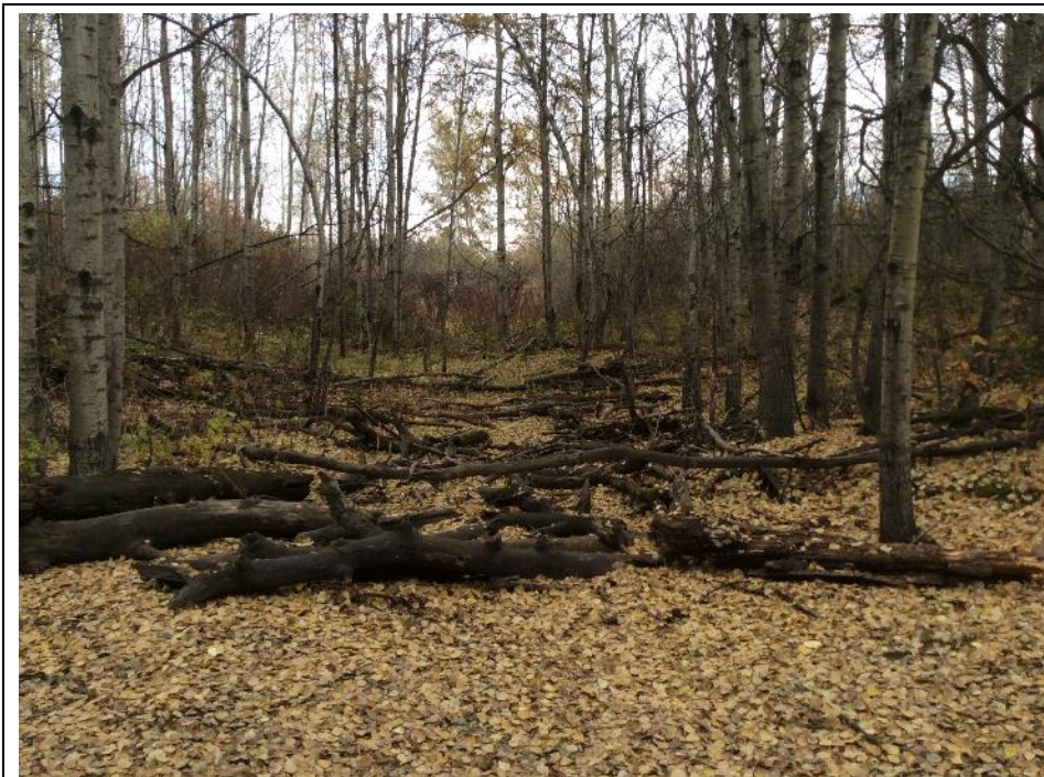
Photo 63 View southwest of the FL-04 outflow site. Photo taken during fall sampling on October 16, 2019.