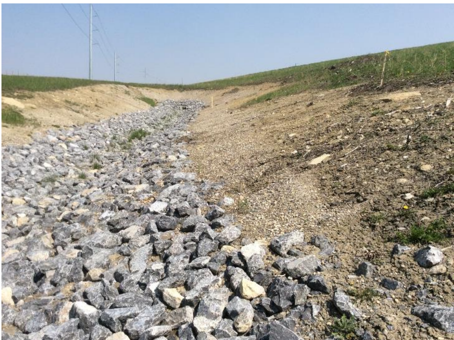
Photo 36 View southeast from WQ-05b sample site at the previous location of sample site WQ-5c, located downslope of the SWCRR Project and Wetland 09. Photo taken during spring sampling on May 29, 2019.