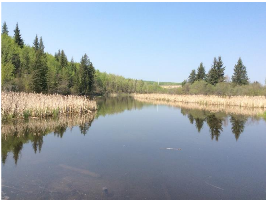
Photo 19 View east from WQ-03 sample site, located within Wetland 06. Photo taken during spring sampling on May 29, 2019.