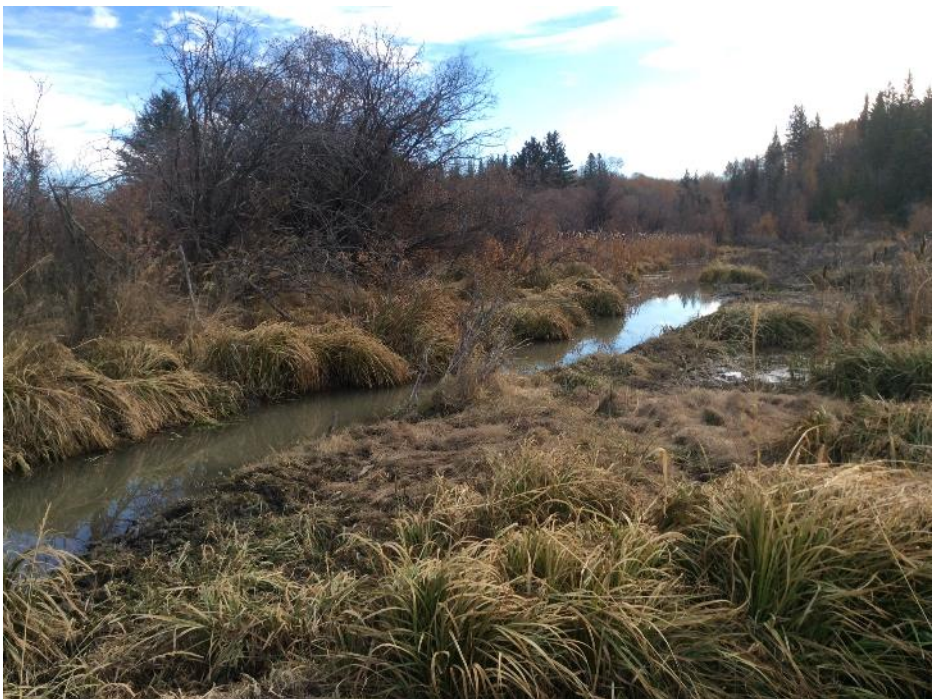
Photo 16 View west from WQ-02 sample site, located within Wetland 06. Photo taken during fall sampling on October 16, 2019.