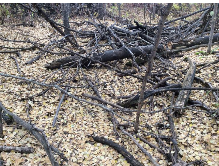
Photo 64 View of ground conditions at the FL-04 outflow site. Photo taken during fall sampling on October 16, 2019.