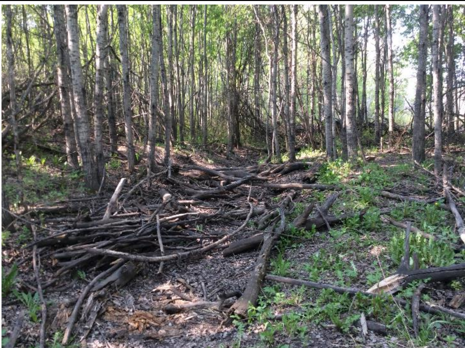
Photo 62 View east of the FL-04 outflow site. Photo taken during spring sampling on May 29, 2019.