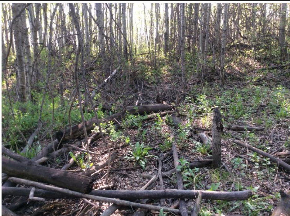
Photo 61 View southwest of the FL-04 outflow site. Photo taken during spring sampling on May 29, 2019.