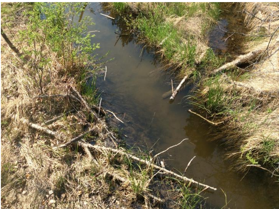
Photo 56 View of the ground conditions at the FL-02 Inflow site. Photo taken during spring sampling on May 29, 2019.