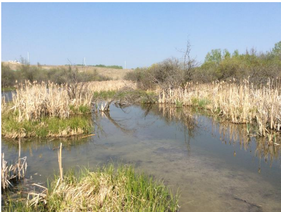
Photo 11 View east from WQ-02 sample site, located within Wetland 06. Photo taken during spring sampling on May 29, 2019.