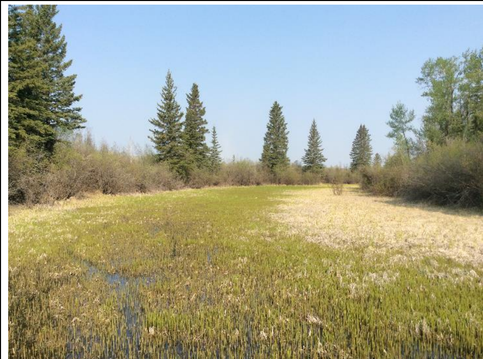
Photo 1 View east from WQ-01 sample site, located within the Reference Wetland. Photo taken on May 29, 2019.