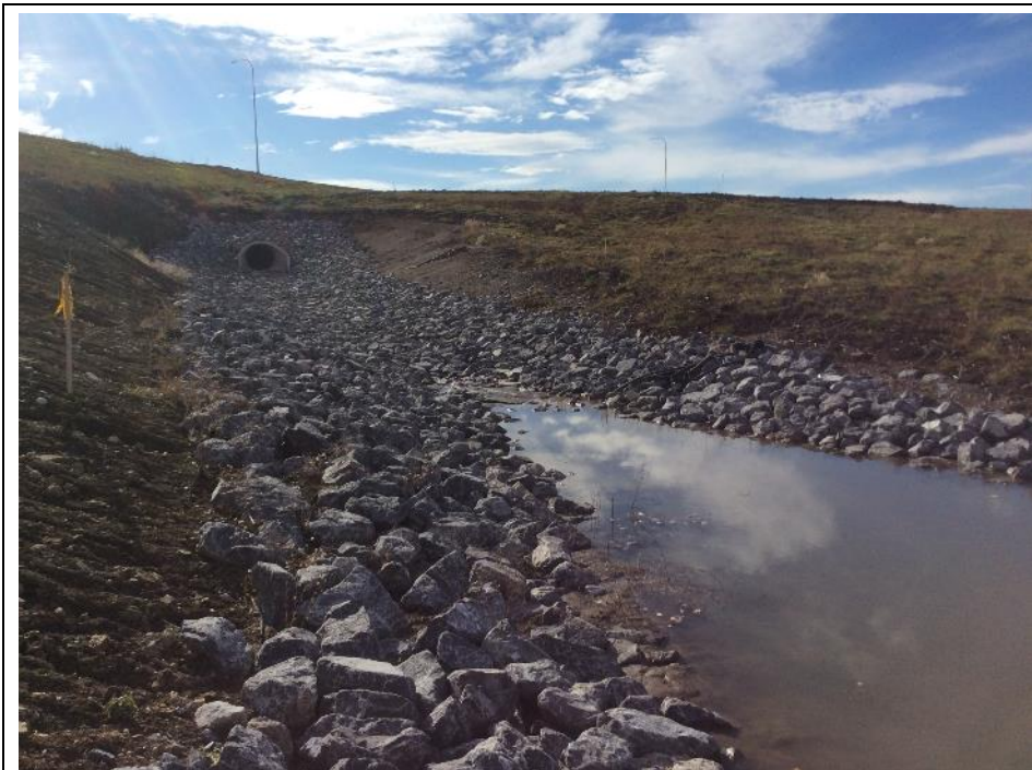
Photo 39 View southwest from WQ-05b sample site, located downslope of the SWCRR Project and Wetland 09. Photo taken during fall sampling on October 16, 2019.