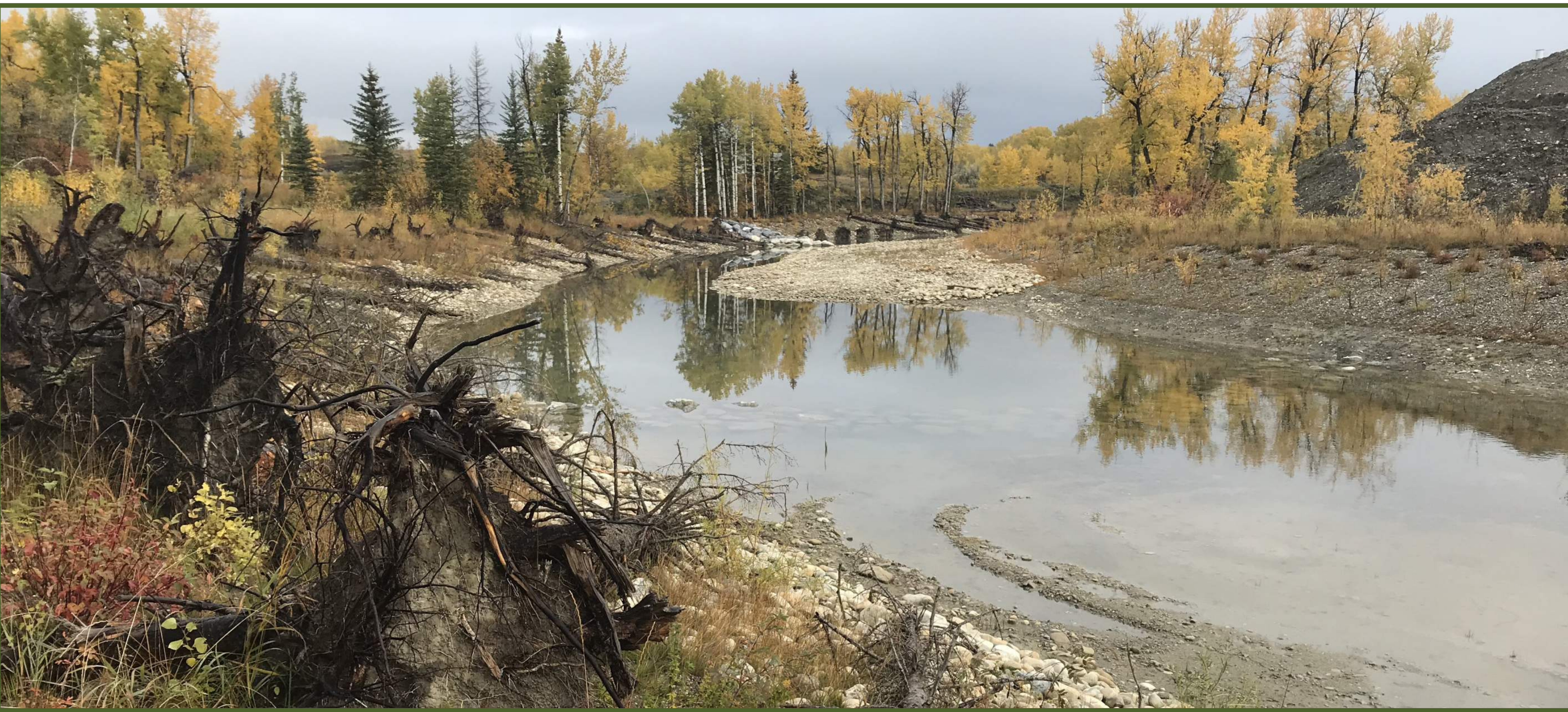
Fish Creek realignment in fall 2018

For discussion purposes only – subject to change