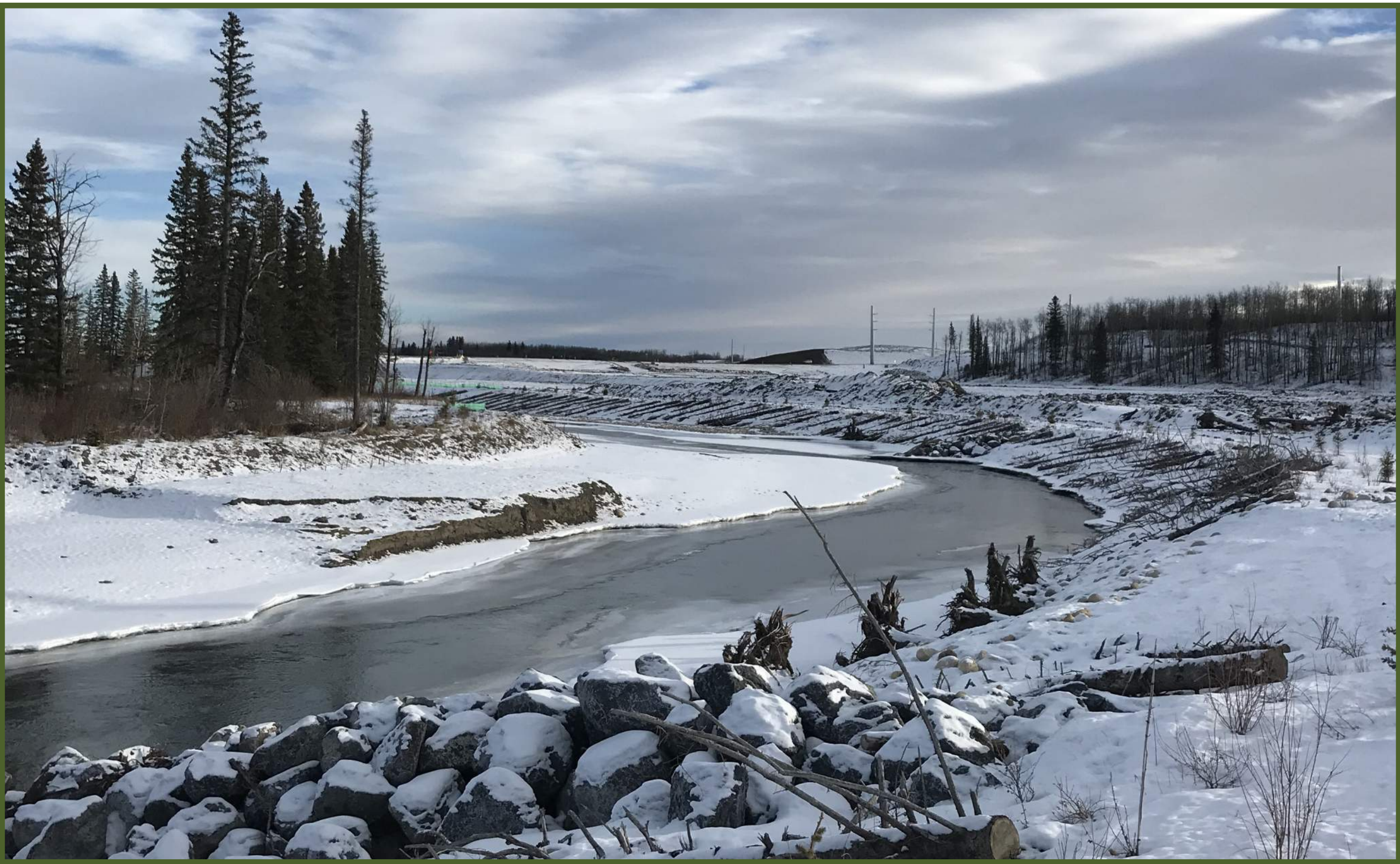
Elbow River realignment in late 2018